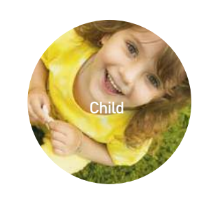
The gentle hot water cleansing and enjoyable massage effect encourage healthy, regular and clean toilet habits in children.